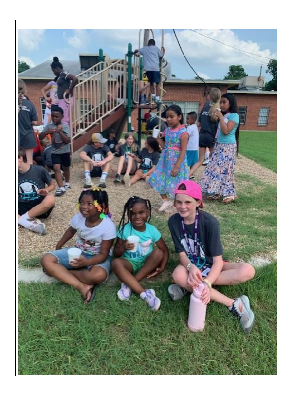
Dad's Day Out at Kate Ross